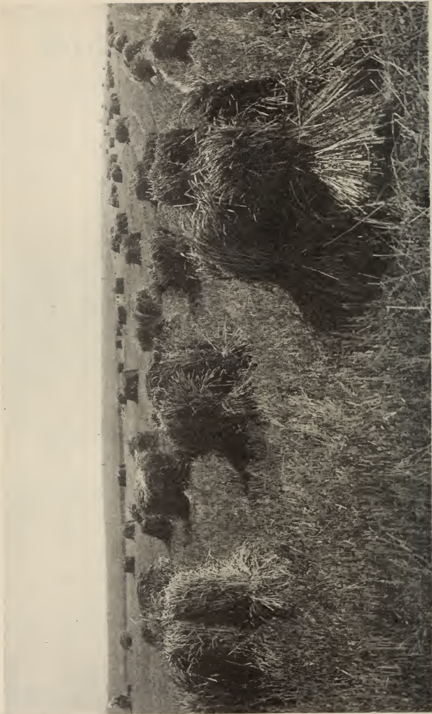
A HARVESTED WHEAT FIELD, NORTH DAKOTA See "The Land of Fertile Prairie and Sunshine" (page 667)